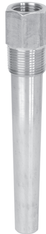
Thermowell to screw in Model TW15-H