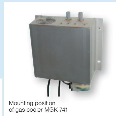
Mounting position of gas cooler MGK 741

Application For dew point reduction of humid gases to help avoid condensation in the analyser. A stable gas outlet dew point avoids water vapour cross sensitivity and volumetric errors.